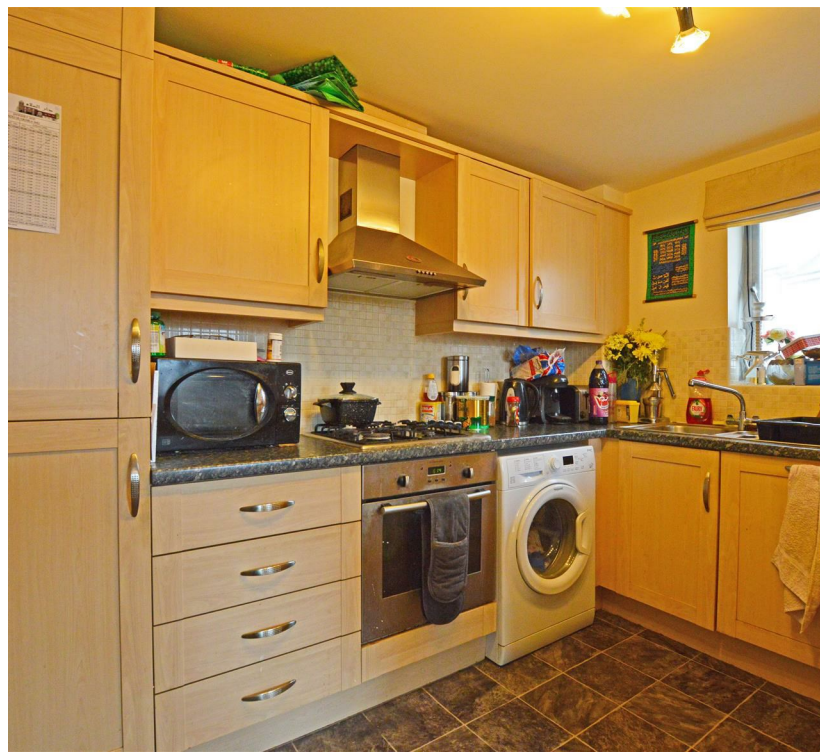
3 Bank Avenue Hampton Centre PE7 8GP